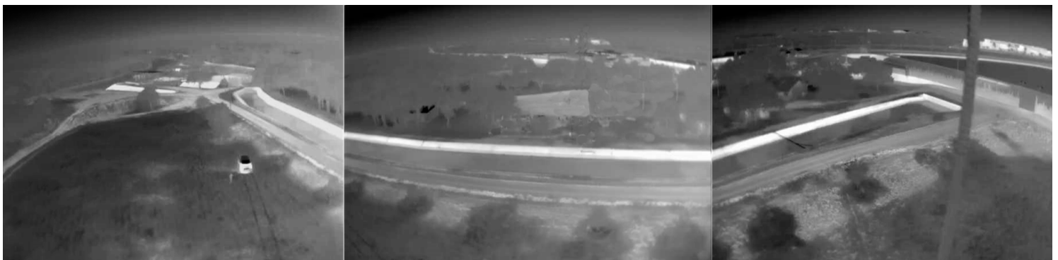
Ultra Wide Angle Thermal Field of View